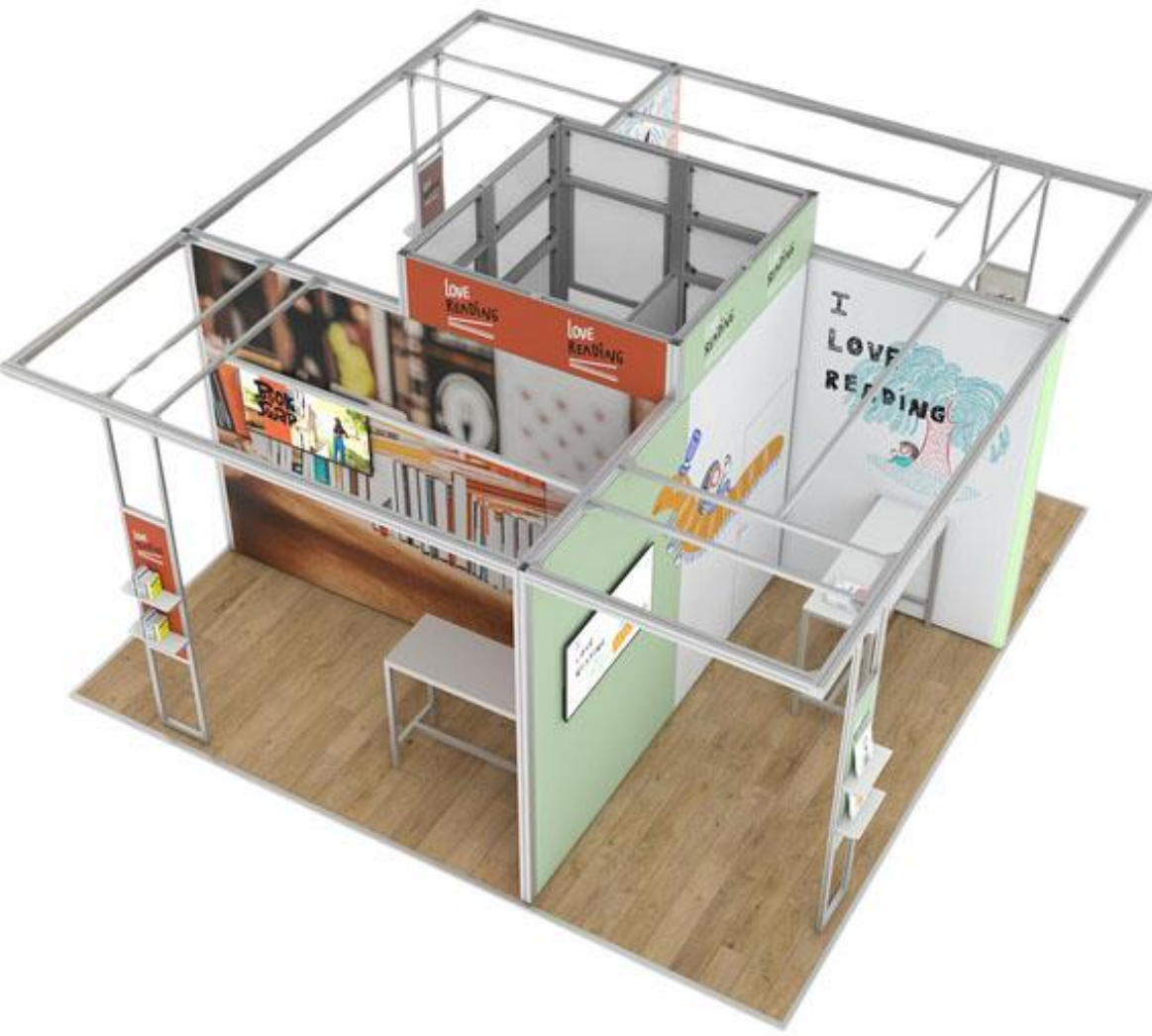
Four Storage Spaces Shared Booth