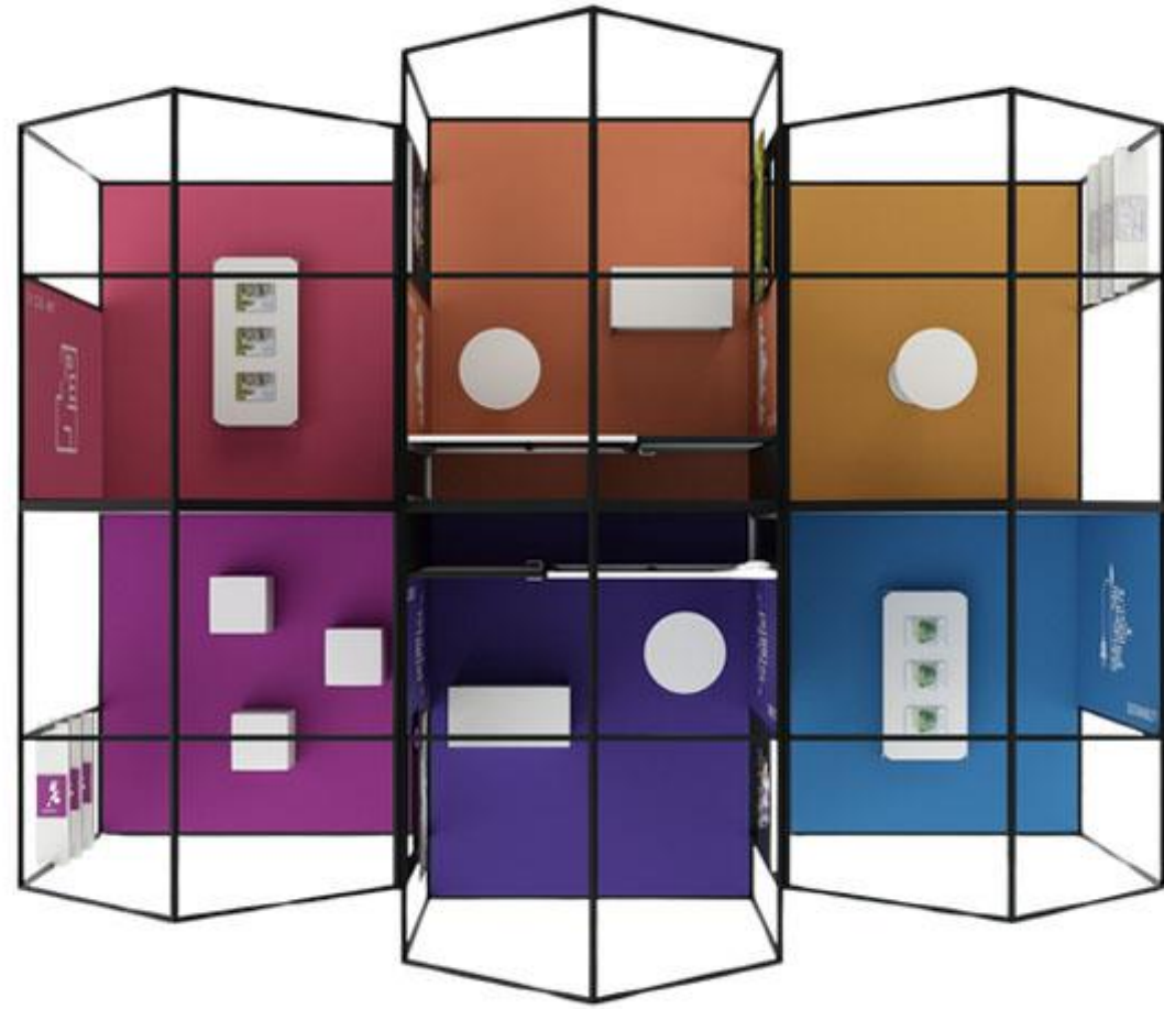
House-like architecture Shared Booth