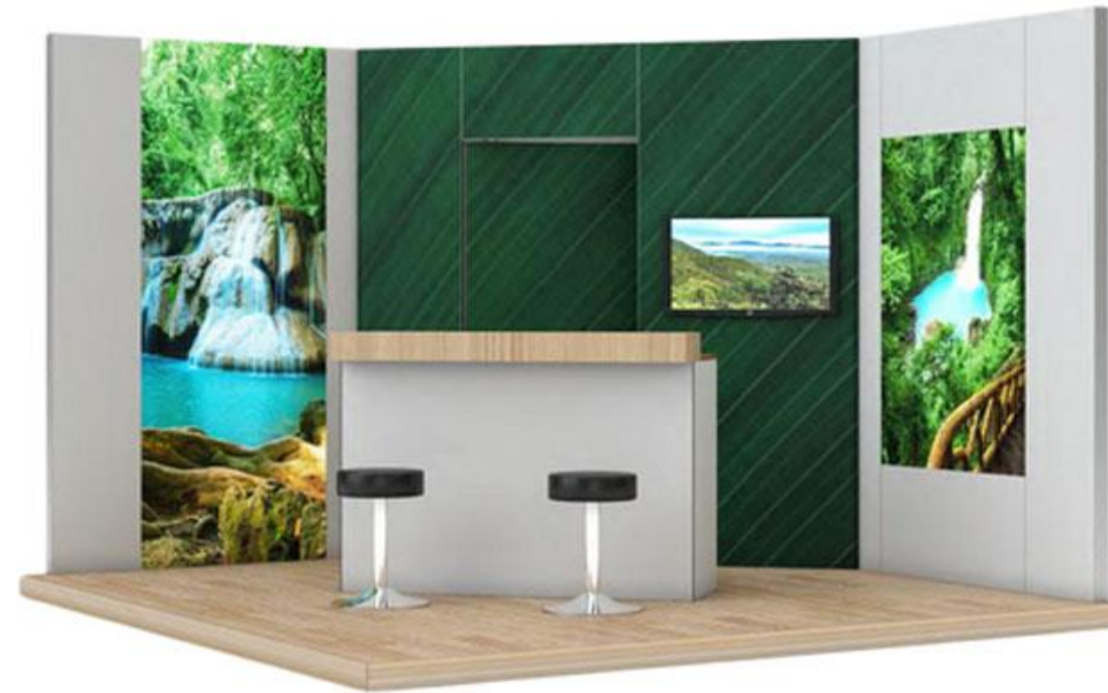
Accessories: Elegant aluminium surface with system groove integration of LED panels.