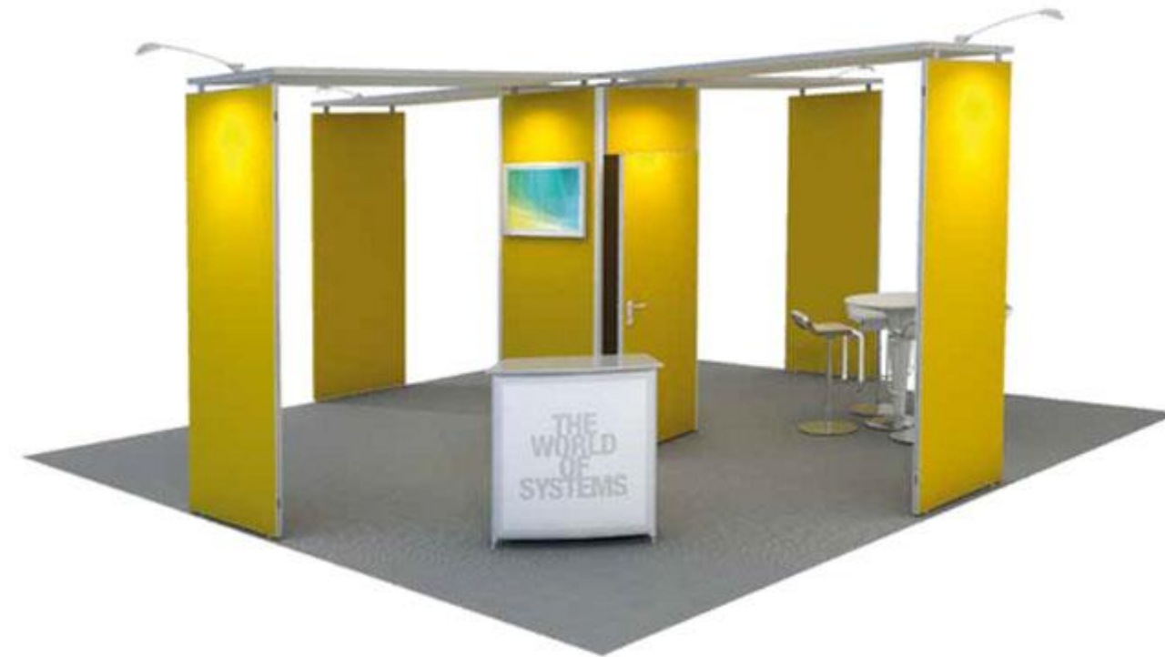
Exhibit with closet and ceiling element