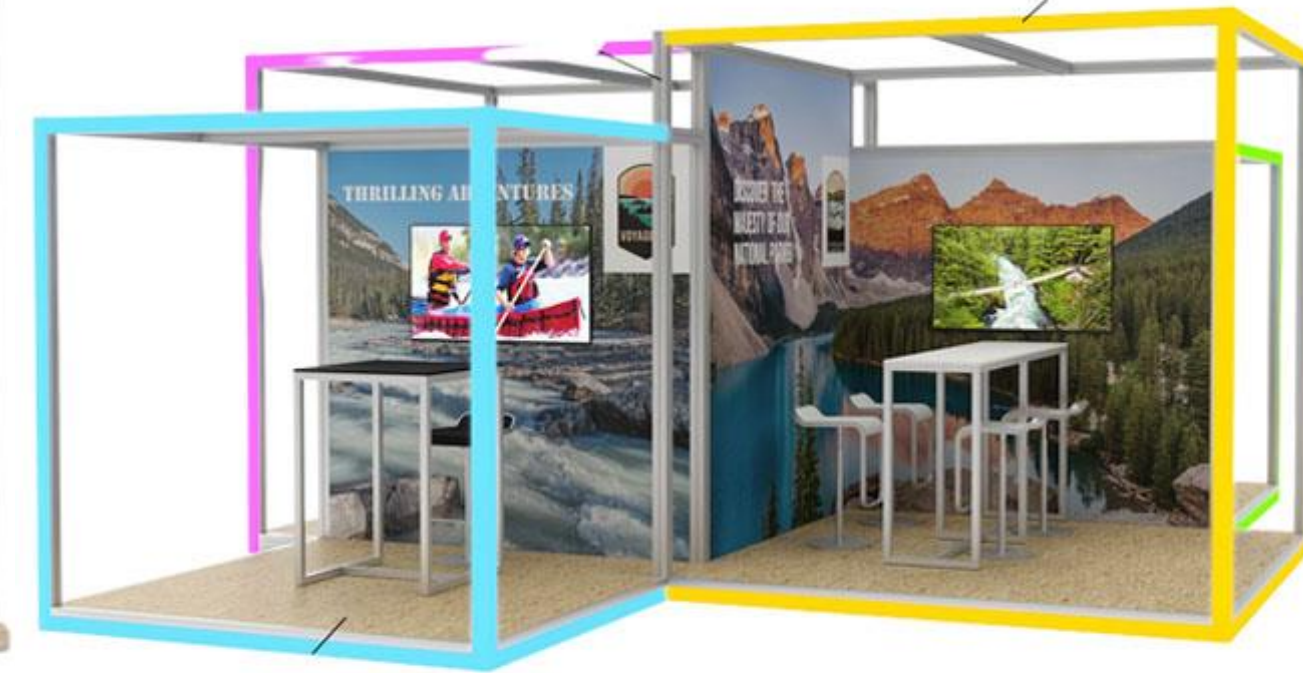
Colour Coding Shared Booth